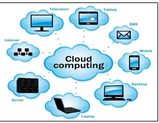
Figure 1: CLOUD COMPUTING

Cloud computing is a collection of technologies that allow IT resources to be virtualized, used on an on-demand basis and delivered via the Internet as services. Cloud computing can be considered a new computing paradigm in so far as it allows the utilization of a computing infrastructure at one or more levels of abstraction, as an on-demand service made available over the Internet or other computer network. It is sold on demand, typically by the minute or the hour; it is elastic -- a user can have as much or as little of a service as they want at any given time and the service is fully managed by the provider. Because of the it's features of greater flexibility and availability at lower cost, cloud computing is a subject that has been receiving a good deal of attention