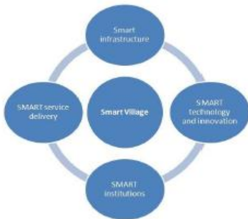
Fig-1: Components of Smart village

The „Smart Village-Smart Ward“ programme will adopt the following approach in achieving its consequences with Swachh Village/Ward and sustainable development of resources as overall guiding principle: