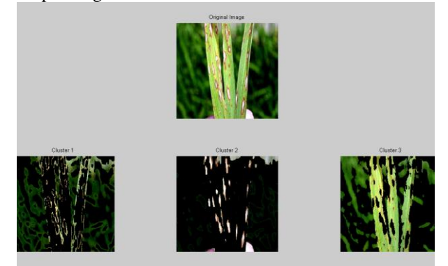
Figure 4: Image Segmentation of Rice Crop Image

The K-means clustering is used for classification of object based on a set of features into K number of classes. The classification of object is done by minimizing the sum of the squares of the distance between the object and the corresponding cluster.