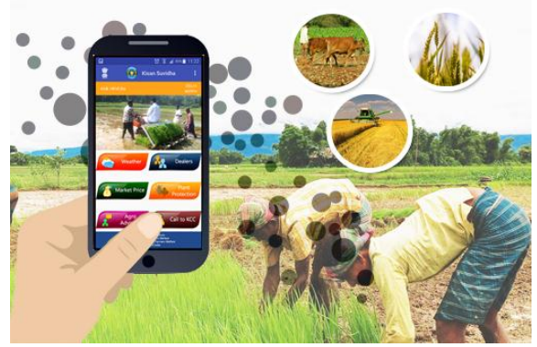
Fig 3 Kishan Suvidha App