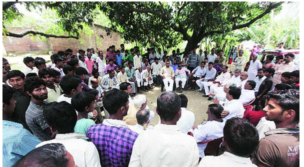
Fig-2 Meetups by Village Peoples

The Sarpanch of the gram with the manager of the IT centre will be going to conduct this session after every 2 weeks of the month on any day. Here all people can discuss about their problem and within one month they find the solution anyhow.