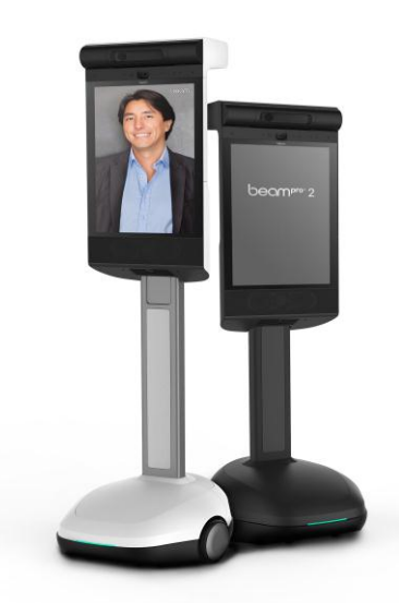
Fig 4 Telepresence Robot

• By making two or more than two on the basis of the population they can fit telepresence robot and maintaining them well. So on emerging Condition, we can save the life.