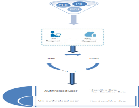
Fig:1 Proposed Architecture of User, Policy and Security System