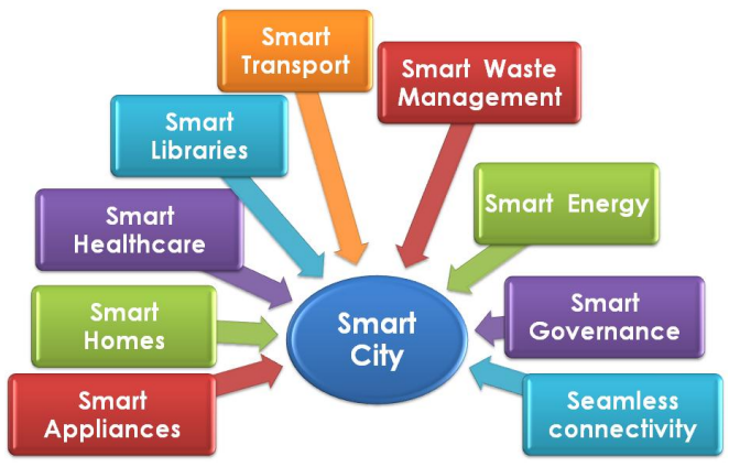
Figure-2: Different Services Provided by Smart Cities

Thus, a smart city, which provides applications for citizens, businesses and governments, is summarized in figure-2.