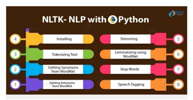
Fig III.II: Natural Language Toolkit(NLTK)

Natural Language Toolkit (NLTK) library is free, open source tool. This library does the core functioning for our application. This toolkit is one of the most powerful natural language processing(NLP) libraries which contain packages to make machines understand human languages and reply to it with an appropriate response. It provides training data sets, Wordnet corpus, various tokenizers, lemmatizers and stemmers. NLTK also includes graphical demonstrations and sample data. It provides easy to use interface to over 50 corpora and lexical resources such as Wordnet.