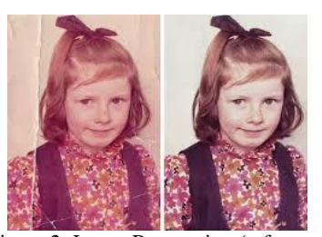
Figure 2: Image Restoration

(ii)In recurrence area, the sifting activity is finished by mapping the spatial space into the recurrence area by taking Fourier transform of the image function.