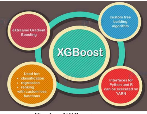
Fig. 1. XGBoost

The three main forms of gradient boosting (Gradient Boosting (GB), Stochastic GB and Regularized GB) can be performed by XGBoost. Also it is capable of supporting fine tuning and addition of regularization parameters. The model is trained on tf-idf features. The terms are weighed by how less frequent they appear as uncommon words are more suggestive for the content. The step by step implementation of this model is as follows: