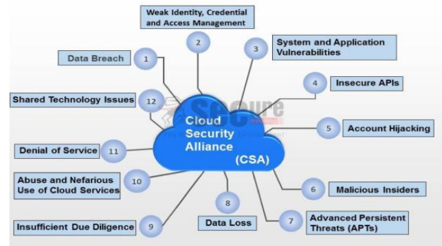
Figure 3. Twelve major cloud security threats according to CSA [11]

12)Advanced Persistent Threats (APTs): These are the cyber attack that penetrates into the systems to set up a bridgehead in the IT infrastructure of the bull-eyed [11] companies from which the data has to be stolen [11]. APTs follow their objectives cautiously over longer periods of time, frequently making adaptations to the suitable measures that have been taken to defend them. Once API's set them at proper positions, they can progress creatively through networks of data centers and can intermingle with the usual network traffic to accomplish their goals.